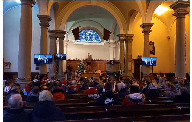
School Christmas Service

There is also an upright piano in the hall.