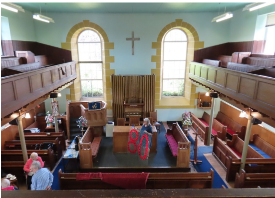
Inside of Leitholm Church from the Balcony.

Under the balcony there is a welcoming vestibule with a small kitchen to one side and a vestry to the other side and compliant toilets. The entrance is accessible by a ramp.