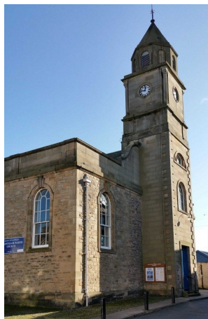
Coldstream Parish Church