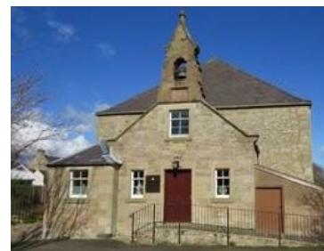
Leitholm Parish Church

We are at the start of a new chapter for Coldstream and District Parishes linked with Eccles & Leitholm Parish Church – a charge shaped by centuries of faith and deep community roots.