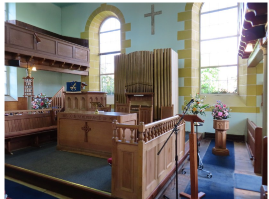
Pulpit, communion table and organ in Leitholm Church