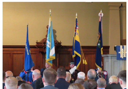
Civic Week Service

There is now an extended raised platform at the front of the church to create more room for those presenting worship.